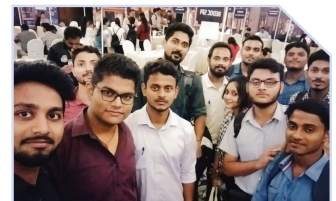
Choose France Programme, Taj Bengal for Higher Studies in France, CDC initiative.