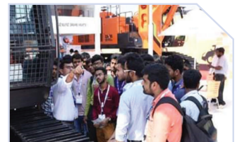
IQOR, Factory & Industrial Training Programme.