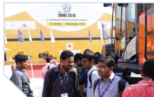
International Mining & Manufacturing Exhibition by CII.