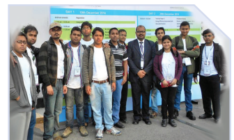
The Indian Society of Heating, Refrigerating and Air Conditioning Engineers (ISHRAE).