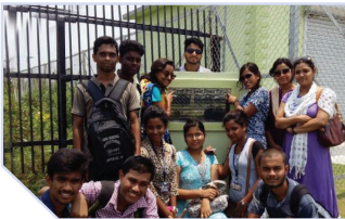
Canal Top Solar Power Plant Visit, an initiative under NKDA.