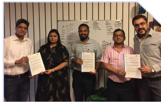
MOU signed between GMIT and CII, Yi. Initiative for GMIT students to get social and corporate exposure.