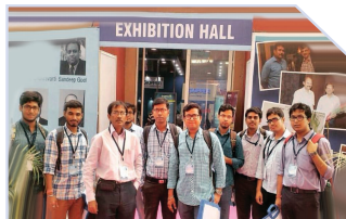
Indian Plumbing Conference.