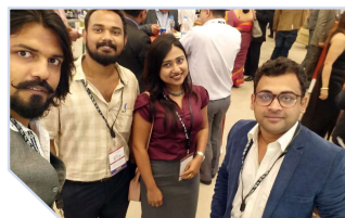
TIE-con meet for entrepreneurship programme.