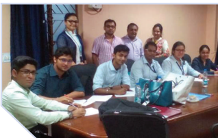
GMIT placement drive, Genpact.