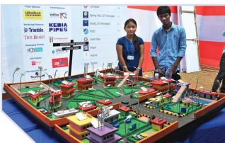
MEGALITH 2016 organised by IIT Kharagpur, GMIT won 2nd place presenting Engineering College Model.